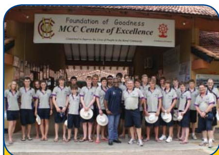
The cricket team and GSAL staff visit the Foundation of Goodness charity at Seenigama.

During the trip the team also had the chance to see the results of six years of fundraising for the Seenigama community which suffered in the Boxing Day tsunami.