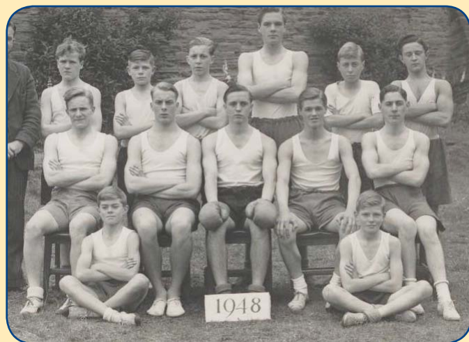
1948 Boxing Team.