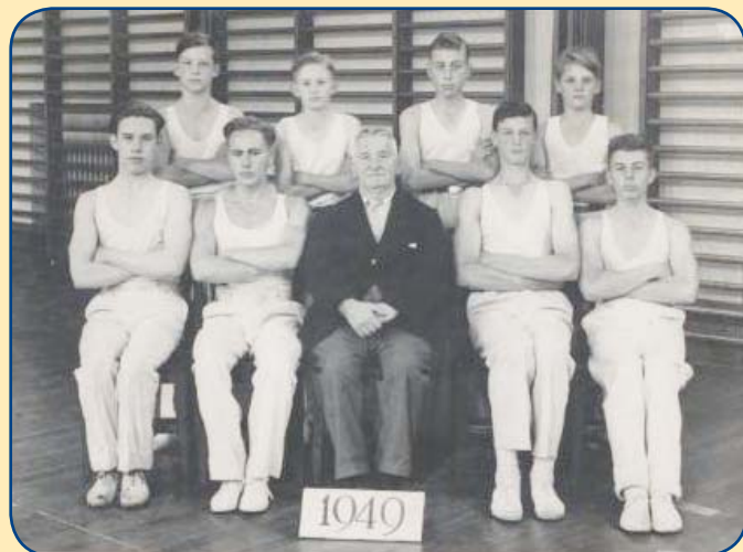
1949 Gym Team.

'One of the benefits of the merger will be school plays and presentations. In my time – late 40s, early 50s – boys whose voices had not broken played girls' parts. I was Lady Macduff in Macbeth ; Lady Capulet in Romeo and Juliet ; and Gwendolen in The Importance of Being Earnest . It was with considerable relief and considerable pleasure that I 'graduated' to the role of Fluellen in Henry VI !